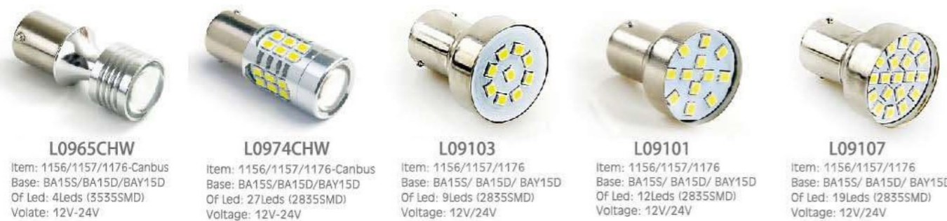
L0965CHW Item: 1156/1157/1176-Canbus Base: BA15S/BA15D/BAY15D Of Led: 4Leds (3535SMD) Volate: 12V-24V