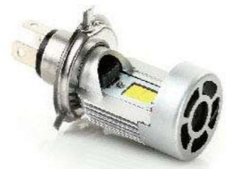
L2415H with Fan

Base: P43T Item: Motorcycle Bulbs Of Led: 2Leds (6W COB) Voltage: 10V-36V