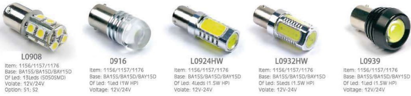
L0908 Item: 1156/1157/1176 Base: BA15S/BA15D/BAY15D Of Led: 13Leds (5050SMD) Volate: 12V/24V Option: S1; S2