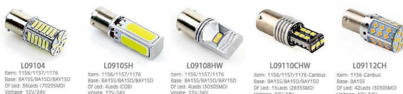
L09104 Item: 1156/1157/1176 Base: BA15S/BA15D/BAY15D Of Led: 36Leds (7020SMD) Voltage: 12V/24V