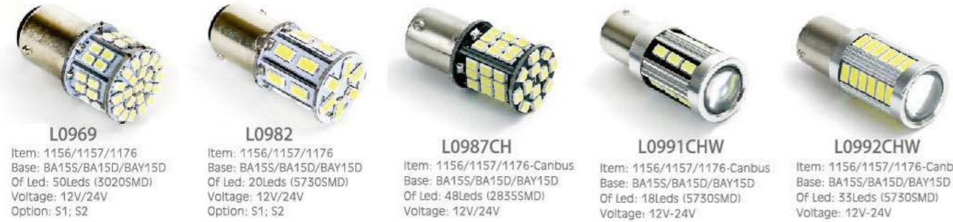
L0969 Item: 1156/1157/1176 Base: BA15S/BA15D/BAY15D Of Led: 50Leds (3020SMD) Voltage: 12V/24V Option: S1; S2