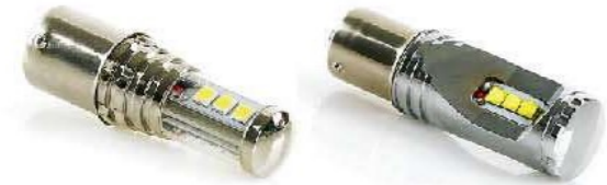
LX01-S25 Item: 1156/1157/1176 Base: BA15S/BA15D/BAY15D Of Led: 9Leds (LG 3030SMD) Volate: 10V-30V