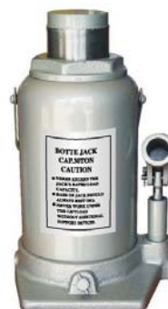
D93006 30 TON