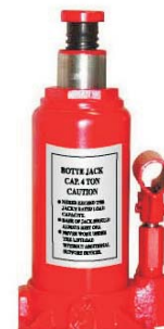
D91008 10 TON