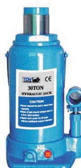
D93003 30 TON