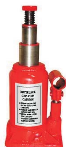
D90605 6 TON