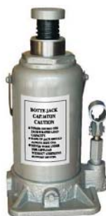
D91606 16 TON