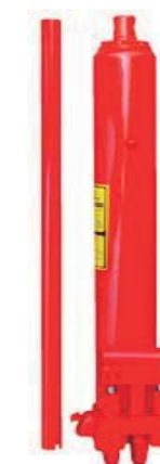
D8004 8 TON