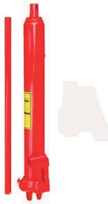
D5001 5 TON