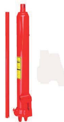
D5002 5 TON