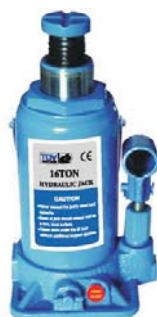
D91603 16 TON