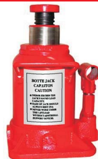
D91204 12 TON