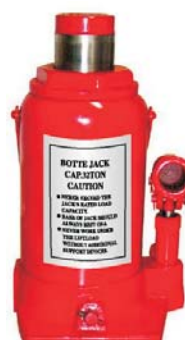
D93208 32 TON