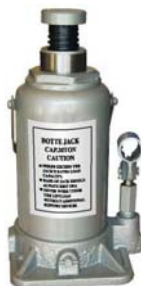
D91607 16 TON