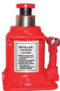
D91604 16 TON