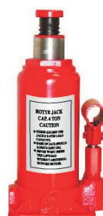
D90808 8 TON