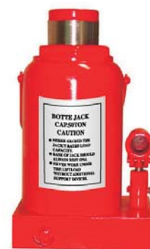
D95008 50 TON