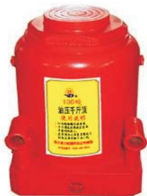
QW-100A 100 TON