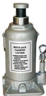
D92007 20 TON