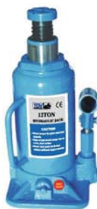
D91253 12 TON