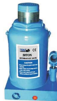
D95003 50 TON