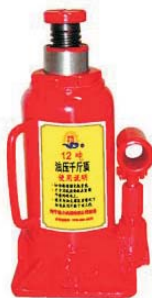
D92002 20 TON