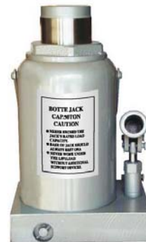
D95007 50 TON