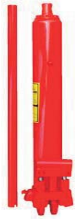
D3003 3 TON