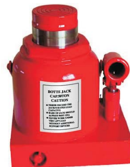
D95004 50 TON