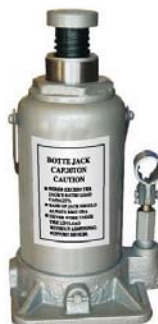
D92006 20 TON