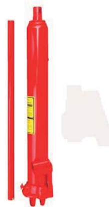
D8002 8 TON