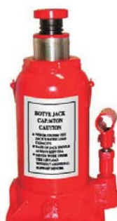
D91608 16 TON