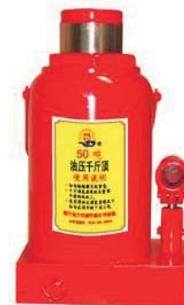
D95202 50 TON