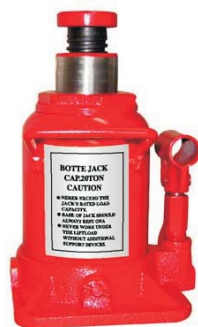
D92004 20 TON