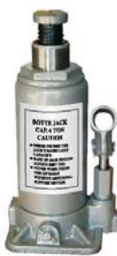
D90507 5 TON