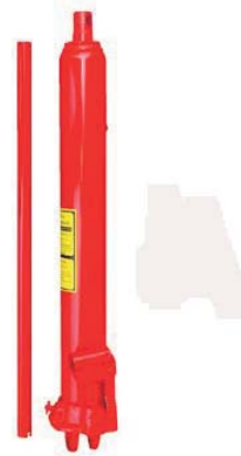
D8001 8 TON