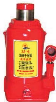
D93202 32 TON