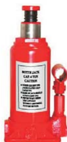
D90608 6 TON