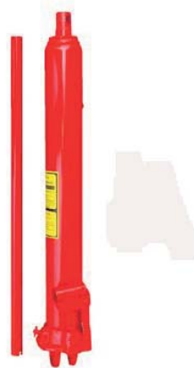
D3002 3 TON