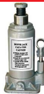
D91007 10 TON