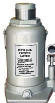
D93007 30 TON