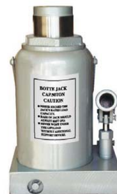
D95006 50 TON