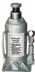
D91256 12 TON