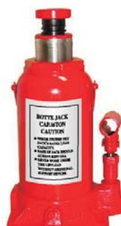
D92008 20 TON