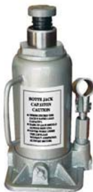
D91207 12 TON