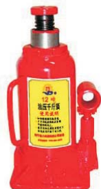
D91602 16 TON