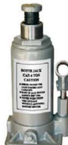
D90807 8 TON