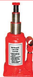
D91205 12 TON