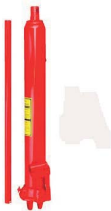
D3001 3 TON