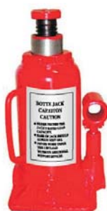
D91208 12 TON