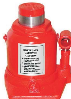
D93004 30 TON