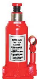
D90408 4 TON