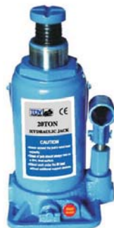
D92003 20 TON