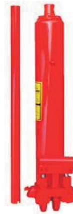
D5003 5 TON